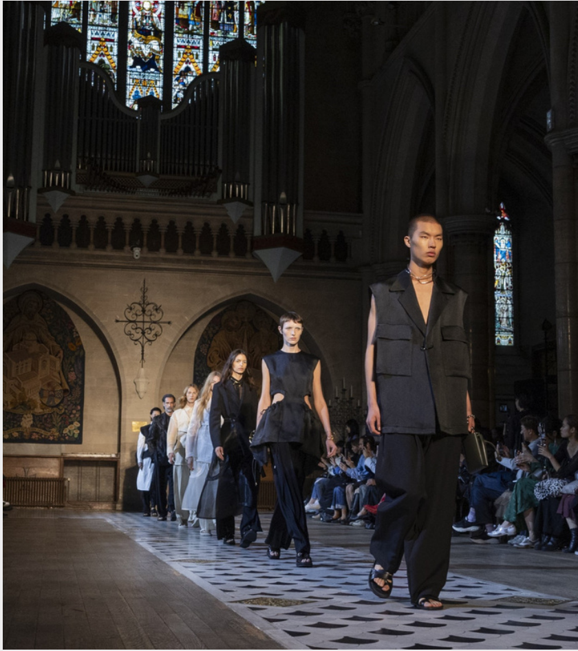
Read – At Paris Fashion Week SS24, Ujoh Delivers a Lesson in Divine Tailoring